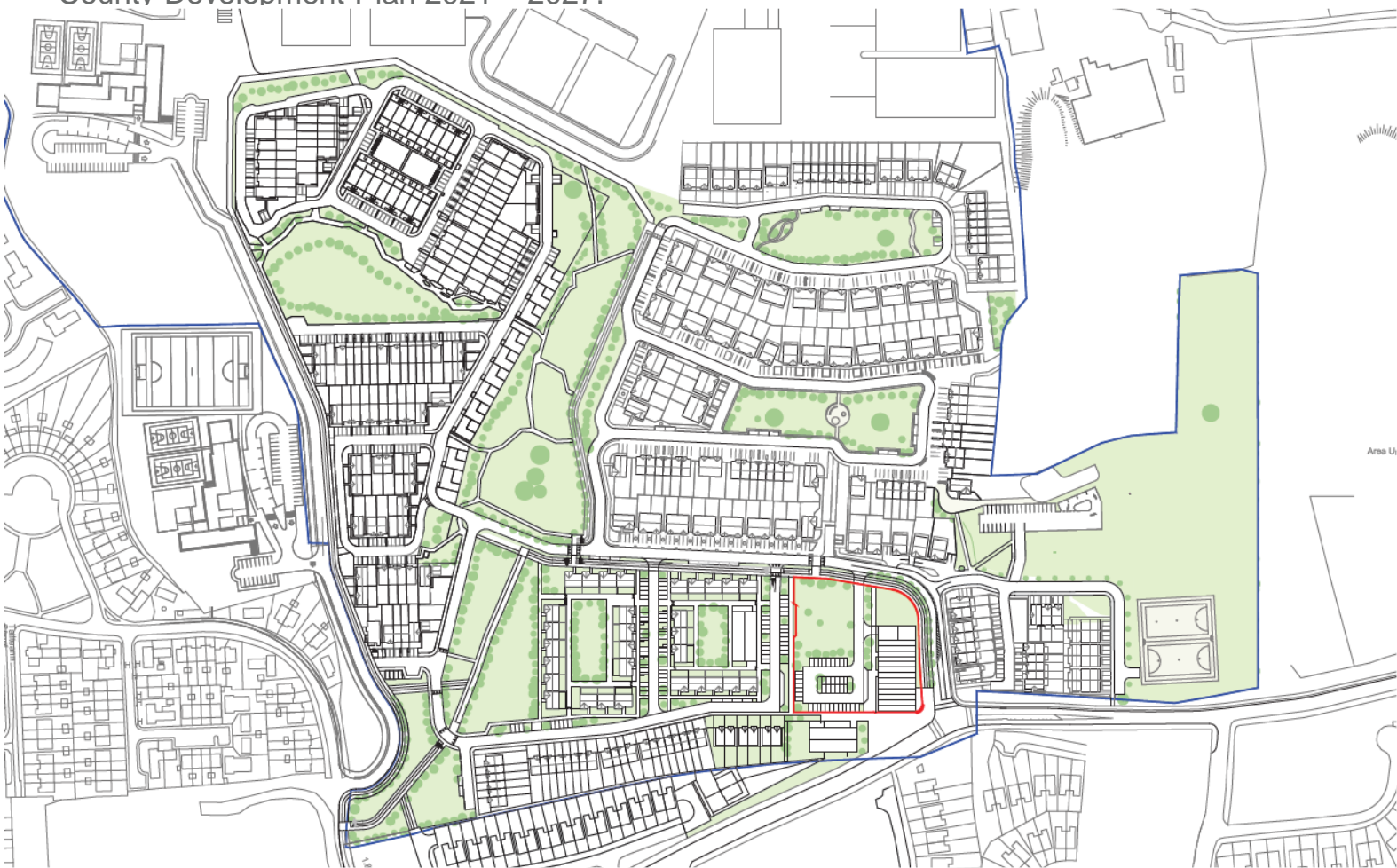
Cluain Adain Overall Masterplan